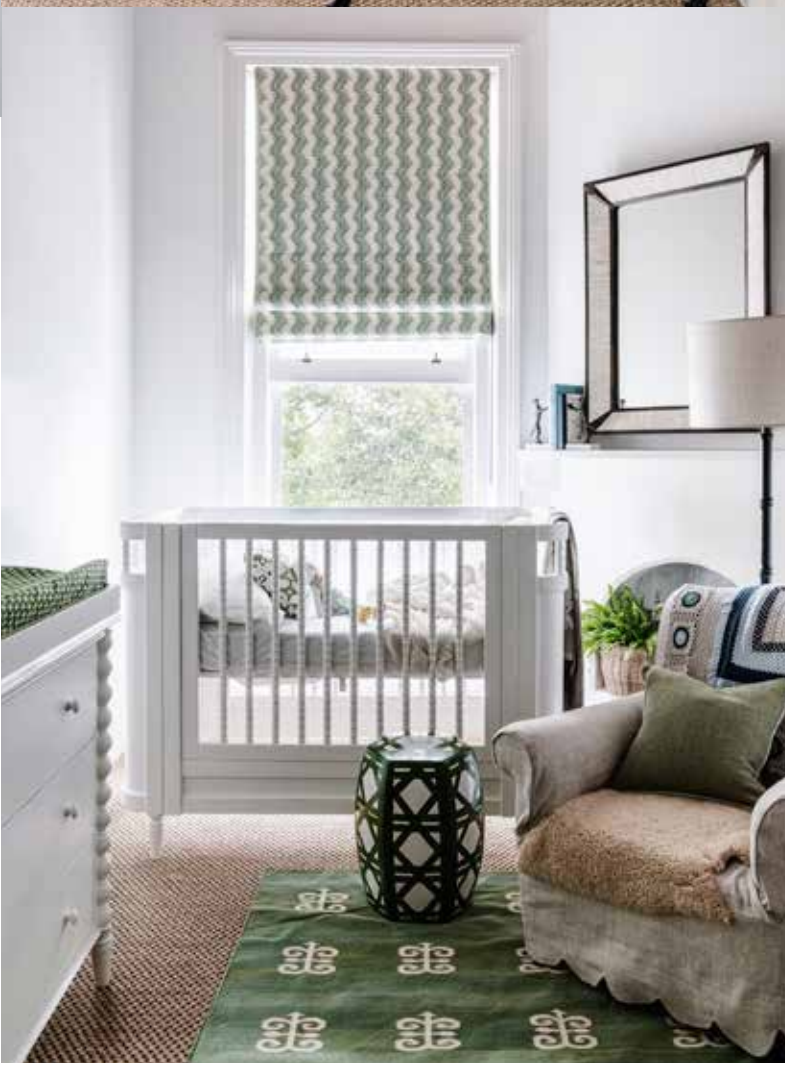
SEPTEMBER 2022 COUNTRY STYLE 69

Most family time is spent in the airy, conservatory-style living room and kitchen. In sharp contrast to the rest of the house, the contemporary space was added onto >